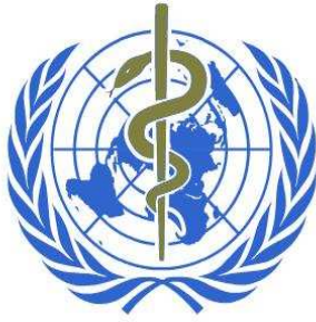
World Health Organization