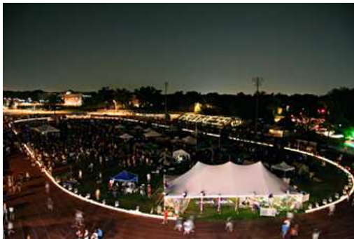
Virginia Tech's Drillfield lit up during Relay for Life

Some of the traditions followed at Relay are the Survivors Lap where survivors are invited to circle the track together to celebrate their victories over